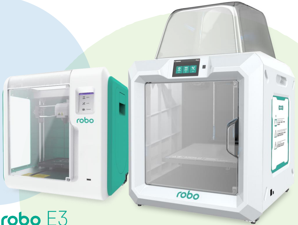
robo E3 Compact 3D Printer

Wi-Fi + Hot Spot enabled for Chromebook and iPad compatibility including Robo cloud printing.