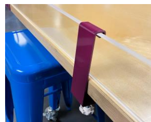
Side Support Clamp