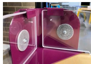
Corner Support & Magnet Connection

Robotics Bumper Kit Shown on Idea Island, but compatible with ED Tables & select Brainstorm Workbenches of 42x72 & 42x84 Metal corner pieces slide onto table corners and polycarbonate sides nest into corners and attach by magnets. Two side clamps also attach to the 72L or 84L sides of table for additional support.