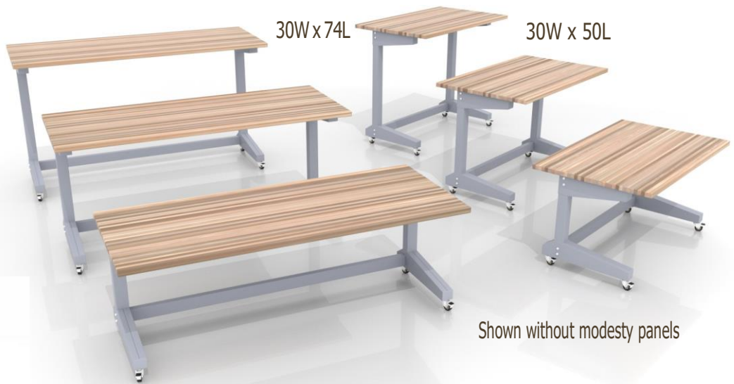
Shown without modesty panels